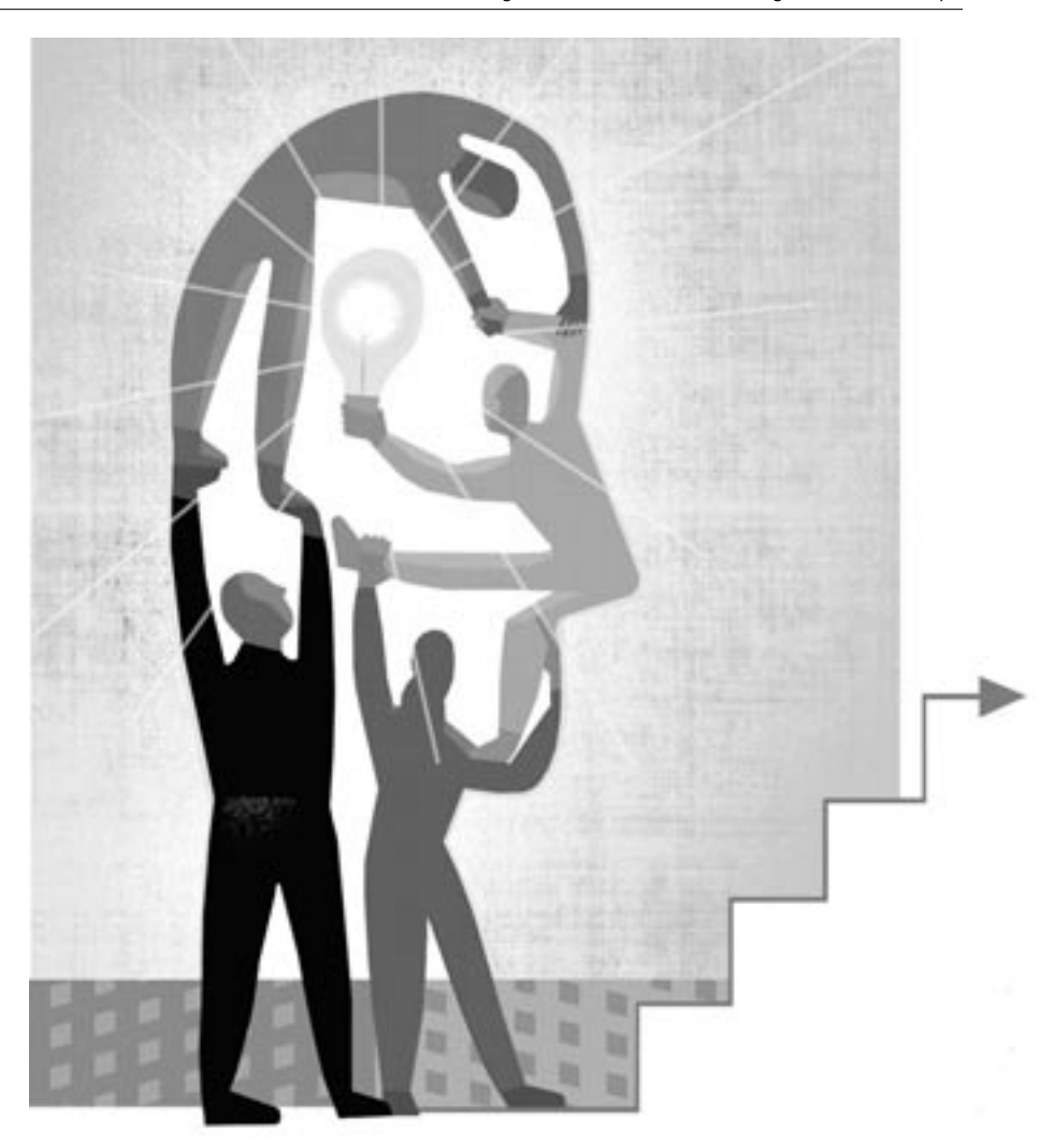
Groups are most creative when their members collaborate unreservedly. People stop holding back when there is mutual trust, rooted in emotionally intelligent interactions.

The most effective teams we have studied go far beyond the occasional "ropes and rocks" off-site. They have established norms that strengthen their ability to respond